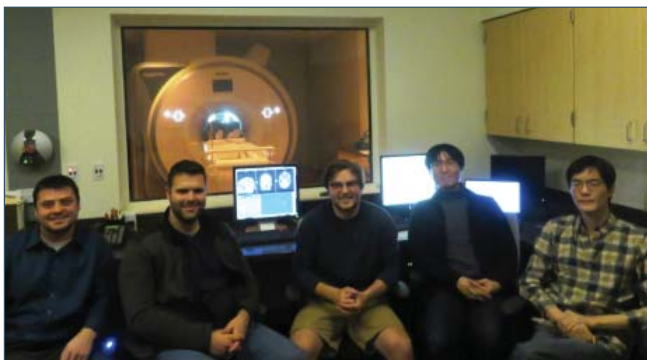
Students enrolled in the Intro to fMRI course practicing brain imaging techniques in the CCBBI control room