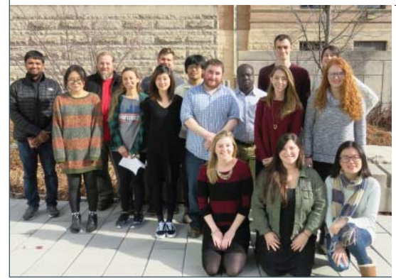
Members of the CCBBI Student Group

If you would like more information about the CCBBI Student Group and how to join, please visit ccbbitstudentgroup.wordpress.com/about .