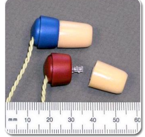
Figure 7. HiFi earphones and the earplugs. Red one is right channel and blue one for left channel (you can remember this by two R's: red for right). The earplugs are screwed on the plastic tubes.

The option (3) gives the best sound quality, but since wires are connected into the magnet bore, and it can introduce noise, although the equipment manufacturer claims the noise is minimal. We recommend to use option (2) if possible.